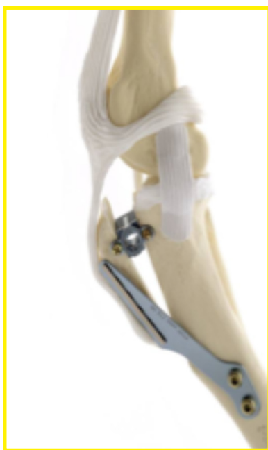
TTA ( www.kyon.ch )

Both procedures involve cutting and moving the bone to change the biomechanics of the joint. The TTA procedure advances the position of the patella ligament such that it is at 90 degrees to the joint surface. The TPLO procedure rotates the joint surface such that it is at 90 degrees to the patella ligament. The decision of whether TTA or TPLO is most appropriate may be based on anatomy of the individual. In many cases, either surgery would be a suitable and appropriate choice. Your surgeon can discuss both procedures with you during consultation.